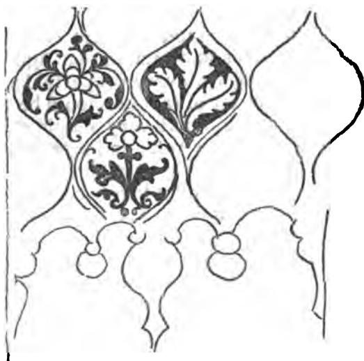
Fig 5. Tundan weda : (hasty sketch for a brocade).

In a more advanced stage, for children seven or eight years old, simple freehand drawing may be treated more systematically, and here I would suggest taking a hint from the local methods, and setting the child first to trace, and afterwards to draw from memory simple curved forms ; not merely mechanical curves, but perhaps the actual waka deka and its simpler developments. I would then proceed to the copying of simple decorative forms, the elements of Eastern, and, in Sinhalese schools, especially Sinhalese design, both geometrical and floral ; the child should learn the names of these forms and be able to reproduce them from memory ; an opportunity for 'dictation drawing' would be thus provided. The real meaning of design can also be taught, by the construction of simple geometrical forms and their combination with the floral forms already referred to.